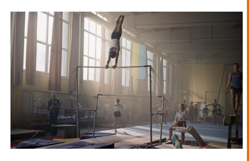
Mature themes, violence and coarse language